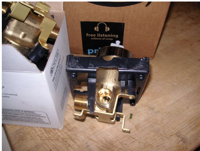
Amazon delivered the Delta MultiChoice shower valves. All bent and mangled.