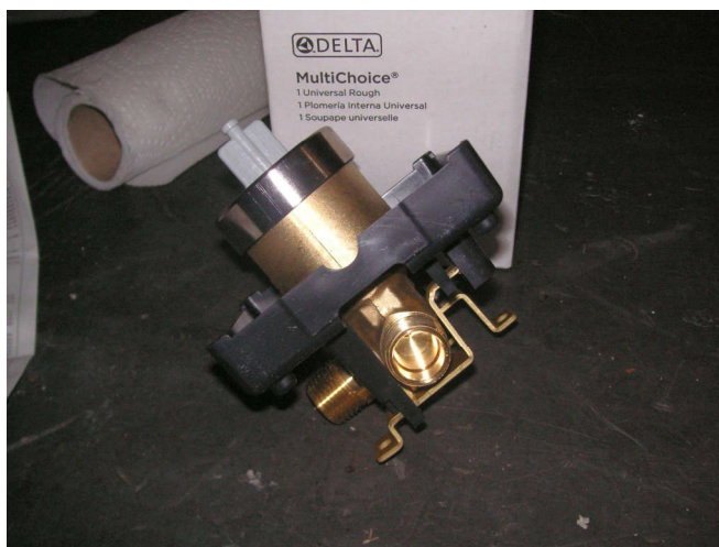
A few minutes to figure out how to straighten them out.