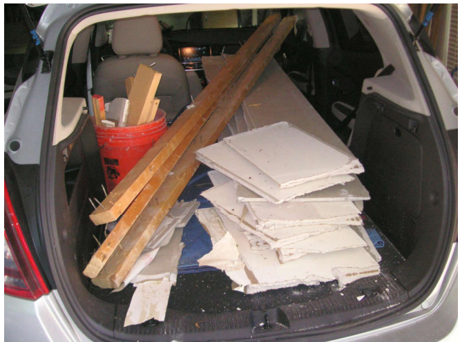
All hail the 2019 Buick Encore that can take 8-foot lumber to the dump.