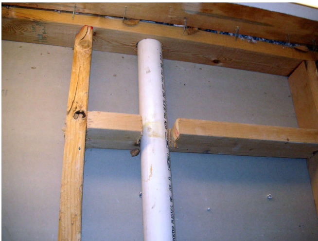
The shorter blade let me cut around the vent pipe without nicking it.