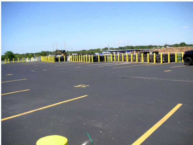
They just repainted the lines, and numbered the dumpsters. They tell you which one to use.