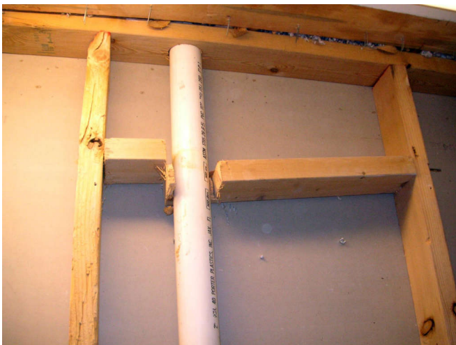
The old wood split so I could pry it down and pull it out.