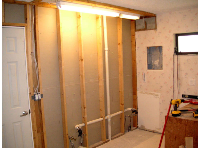
Ta da, now the wall is cleaned of nails, screws and needless lumber.