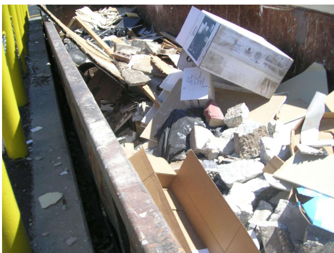
My little dumpster took all the drywall and lumber no problem.