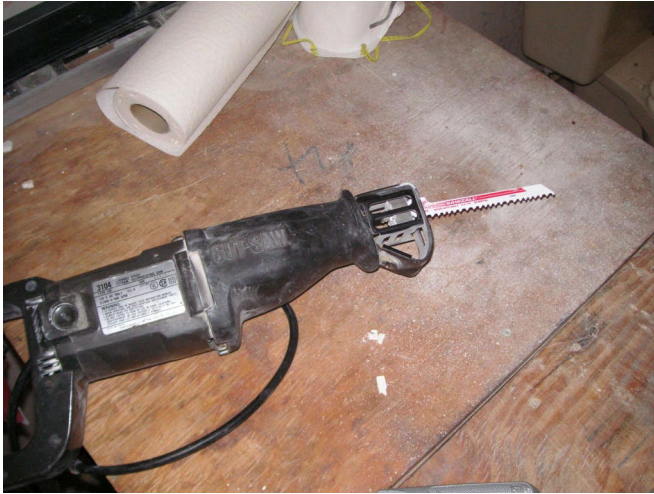
Out comes the old Black and Decker corded saw, with a wood/nail blade.