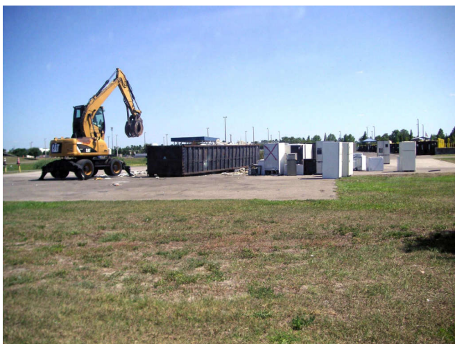
Around the corner, they were crushing up appliances.