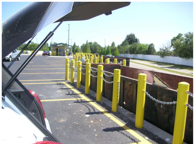
There are dozens of dumpsters, and it is free for county residents. Florida, a first-world state.