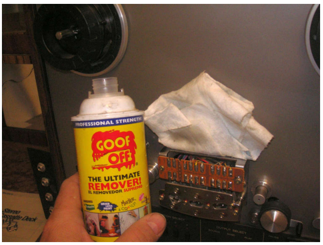
Now that the 10-inch audio tapes are transcribed, I clean up the Teac 3440 4-track.

Leave Cali day 46 - Journal 5/17/2022, 10:21 PM