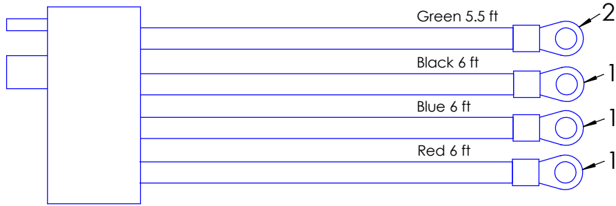
Plug to Rectifier

THE INFORMATION CONTAINED IN THIS DRAWING IS THE SOLE PROPERTY OF RAKO ENGINEERING ANY REPRODUCTION IN PART OR WHOLE WITHOUT THE WRITTEN PERMISSION OF RAKO ENGINEERING IS PROHIBITED.